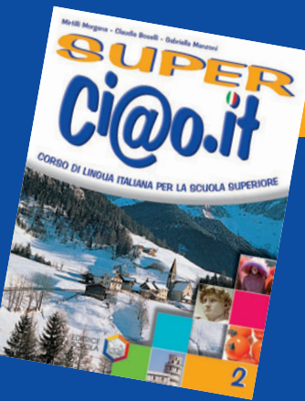
2 Intermedio per gli studenti del terzo anno della High School (grade 11).