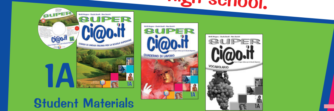
1A Student Materials

The best textbooks to teach and to learn ITALIAN specifically created for the US middle and high school.