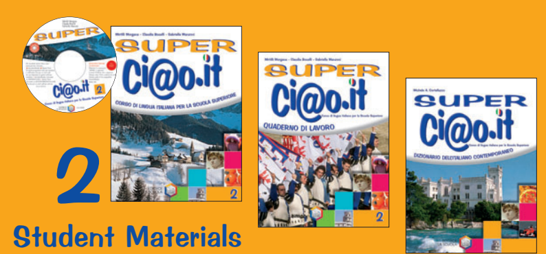
2 Student Materials