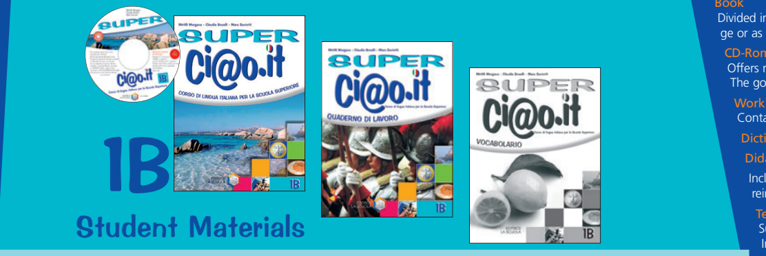
1B Student Materials