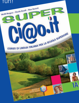
1A. Principiante per gli studenti del primo anno della High School (grade 9) e per gli studenti della Middle School (grade 7/8).