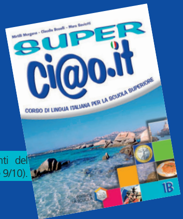
1B. Principiante avanzato per gli studenti del primo o secondo anno della High School (grade 9/10).