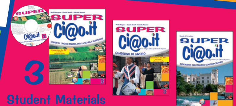
3 Student Materials